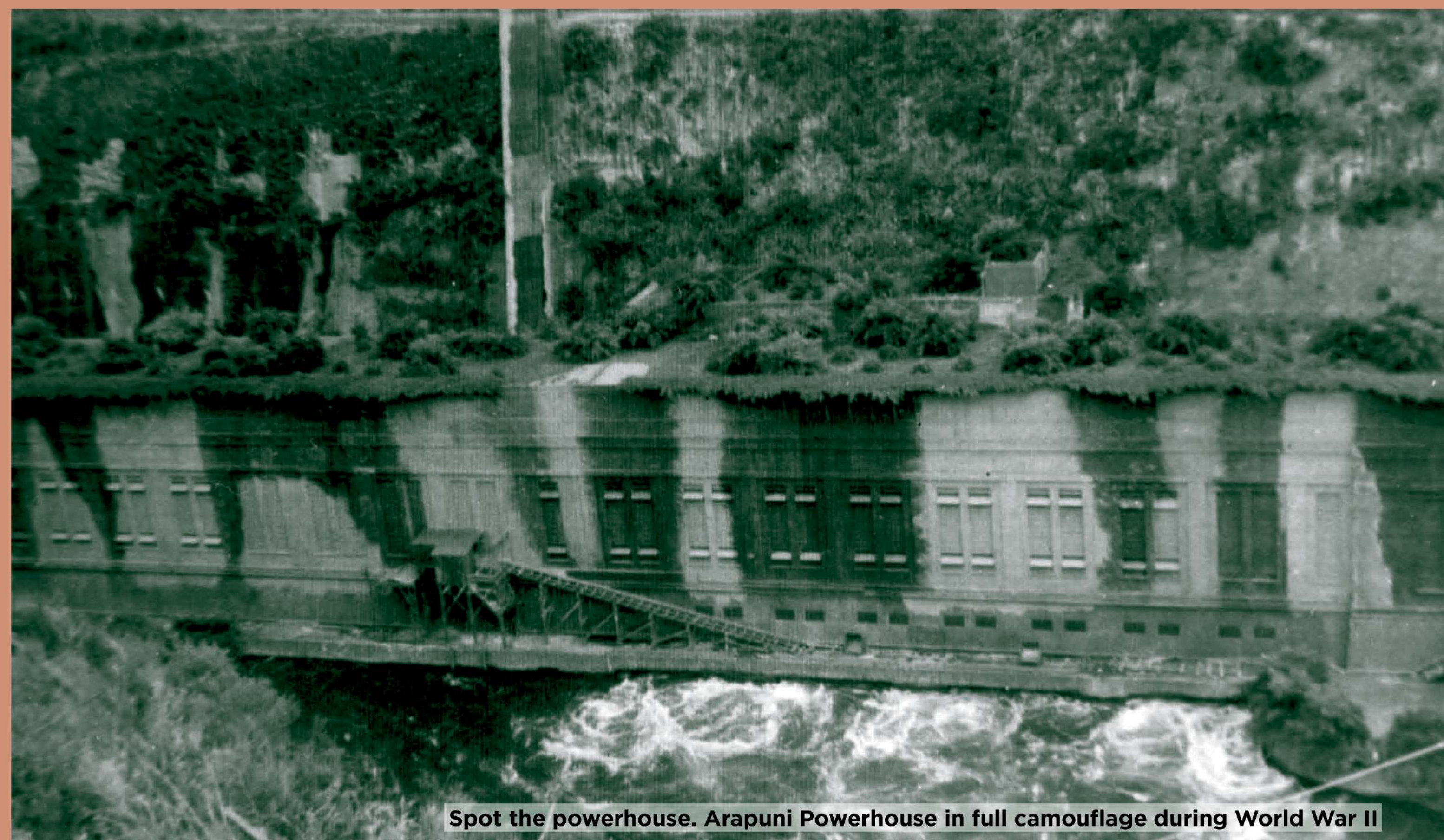
Spot the powerhouse. Arapuni Powerhouse in full camouflage during World War II

Did you know the Arapuni Dam Powerhouse was camouflaged during WW11 to prevent it being targeted during possible Japanese air strikes?